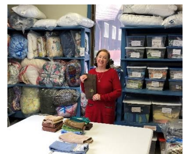
Linen Pantry at Immanuel