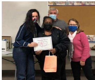
Class Completion Celebration