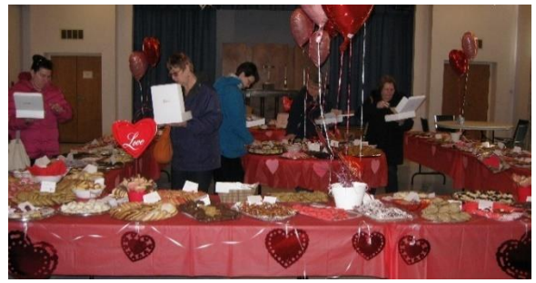
2016 Cookie Walk @ Poughkeepsie United Methodist Church